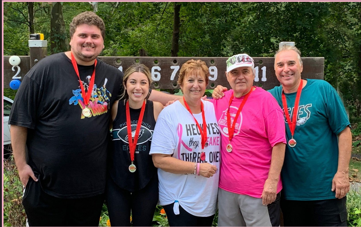
2021 First Place - G-Force